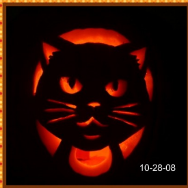
Brady and the kids carved our pumpkin into this cute cat!