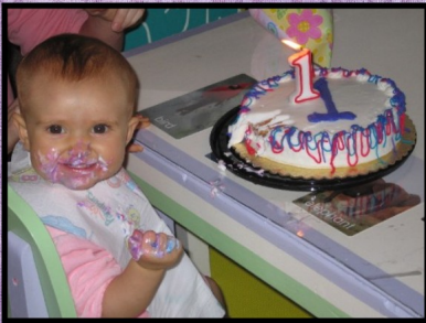
Theme: Hug & Stitches It matched her room decor!