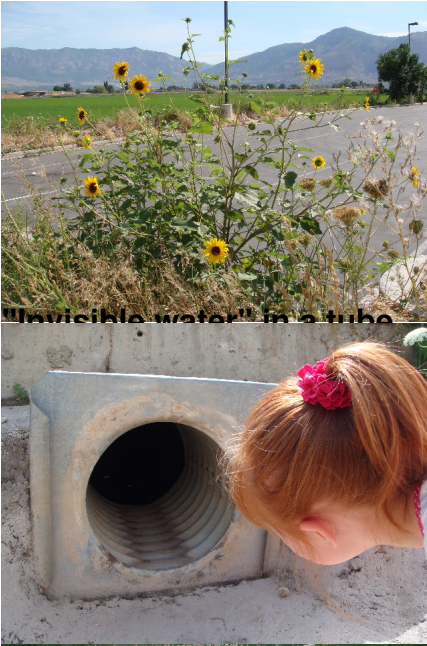
"Invisible water" in a tube

Wednesday, 05 August 2009 00:00 - Last Updated Friday, 07 August 2009 02:38