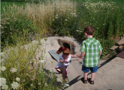
Quickly Discovery and a Dragonfly!