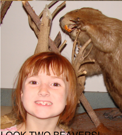
LOOK TWO BEAVERS!