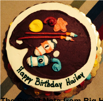
The sweet note from Big Hayley!

Tuesday, 12 November 2013 13:04 - Last Updated Tuesday, 12 November 2013 10:36