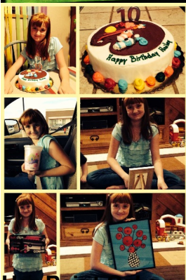
Her Paint Cake