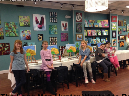
The Lego Man Hunter Wanted to Paint